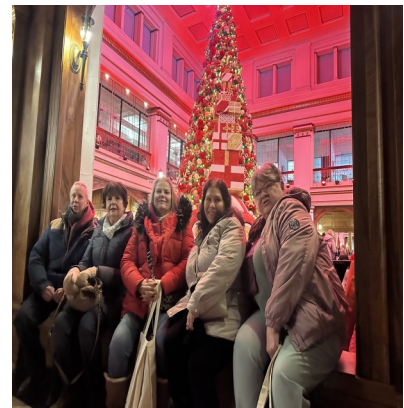
Macy's Walnut Room

We drove to Princeton, Illinois and caught the Amtrak train to Chicago. We visited Macy's and the Christkindlmarket at Daley Plaza. Lunch at "The Gage" was wonderful.