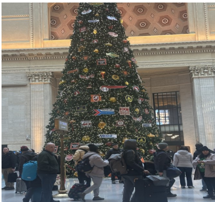
Union Station Christmas