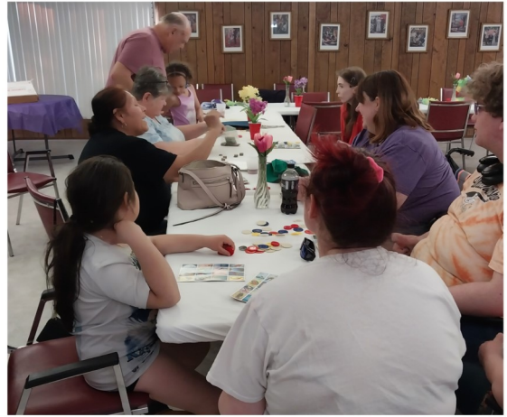
Playing Mexican Bingo